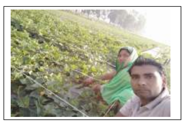
(Cucumber with mulching)