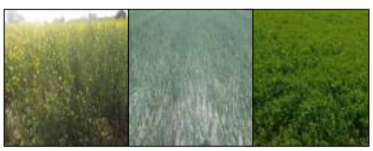
After DFI Crops/System