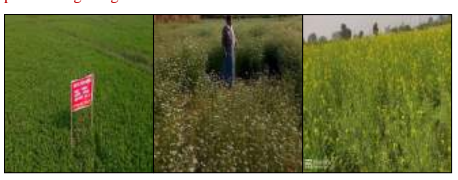
After DFI Crops/System