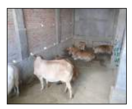
Before DFI System

Brief: The farmer used to get annual income of Rs.137500.00 from paddy, wheat & milk etc. He faced problems like low yield due to old varieties, long calving interval etc. With DFI interventions like HYV, Proper feeding, Management, Introduction of HY Fodders for round the year etc., he is getting annual income of Rs.620000.00.