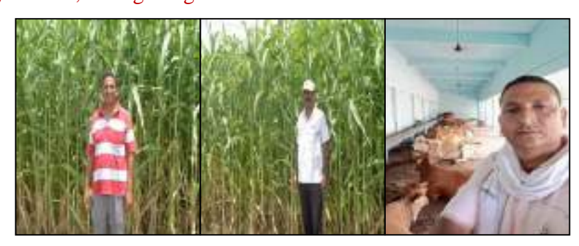
Fodder & Cattle shed after DFI Crops/System)