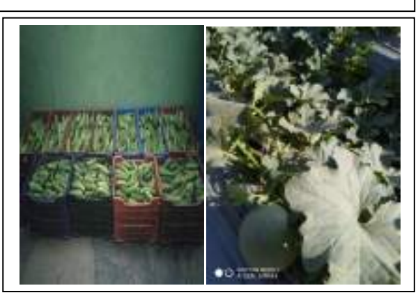
(Cucumber and melon after DFI)