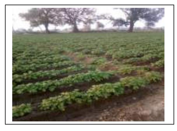
(Potato Before DFI)

The farmer having 5.0 ha land. In 2016-17, he grows paddy (PB 1121 and), potato (K. 3797, Chipsona 1), moonbeam (PDM 139), urdbean (Shekhar 2) summer maize. By these different cropping system combinations he earned net profit of Rs. 416500 annually. In the year 2020-21 with DFI Interventions with KVK scientist like high yielding varieties, management of insect pest and production of disease free potato seed through tissue culture and multiplied in the field and after grading he got net about Rs. 790250/ ha annually which is 89.73 % higher than base year.