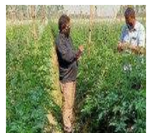
Caption (After DFI Crops/System)