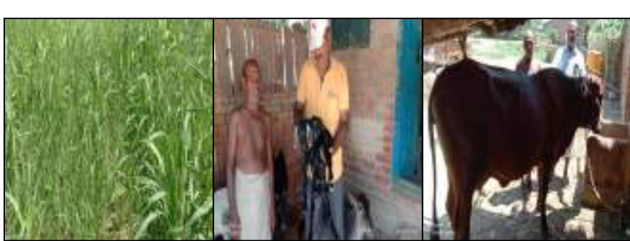
After DFI Crops/System