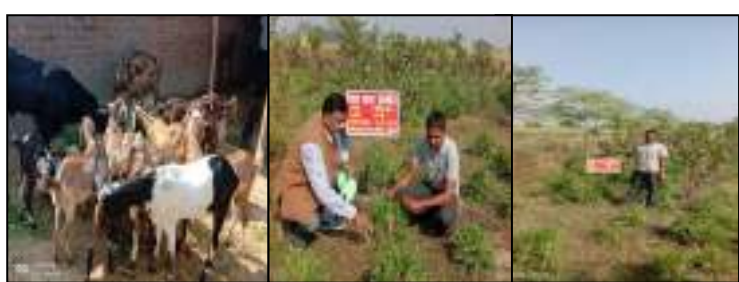
Before DFI Crops/System