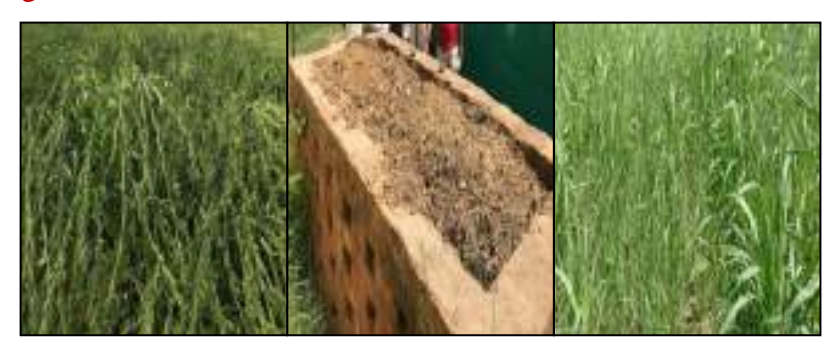
Before DFI Crops/System