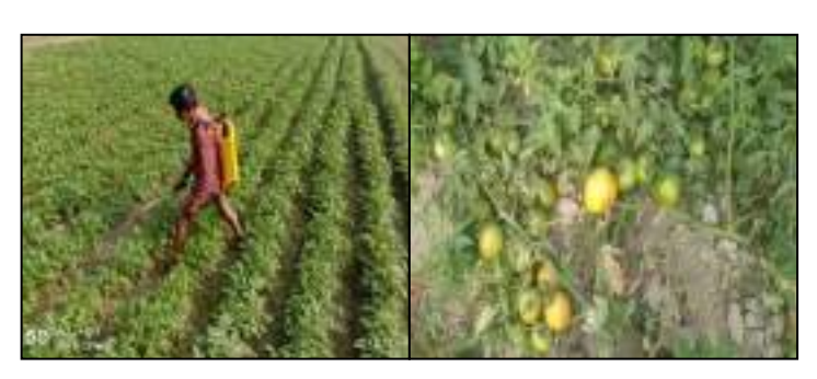
(After DFI Crops/System)