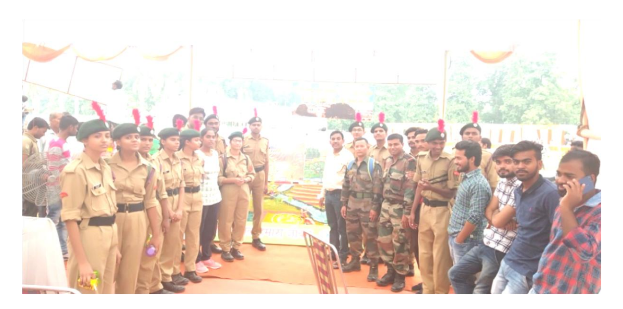
NCC Cadets participating in Farmers fair organized by university