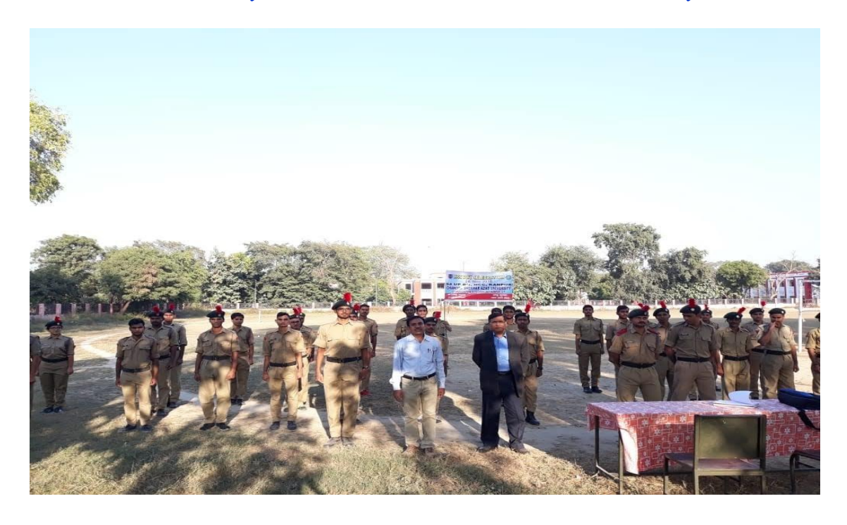
NCC Day 24 November 2018 Celebrated(Rally) by NCC Cadets