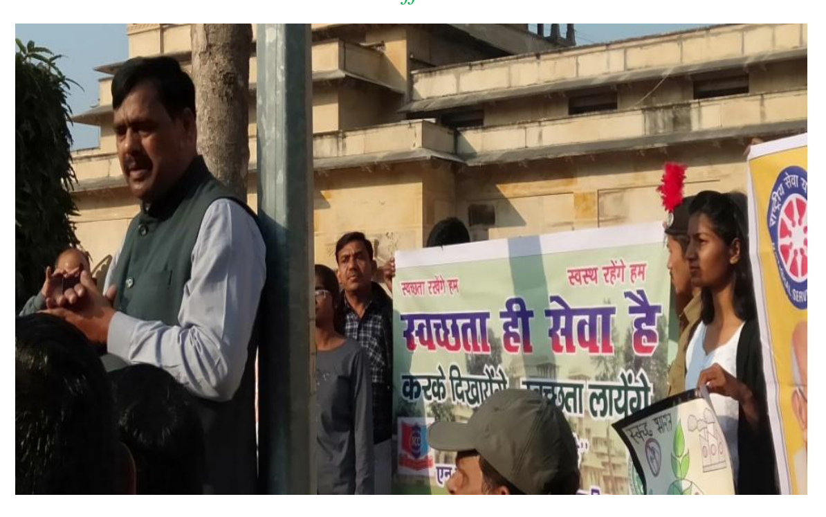
On the Occasion of Swachha Bharat Abhiyan, Honorable Vice Chancellor sir with NCC officer and NCC Cadets