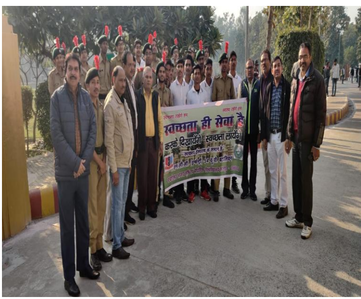
On the Occasion of Swachha Bharat Abhiyan, NCC officer and NCC Cadets with faculty of the University