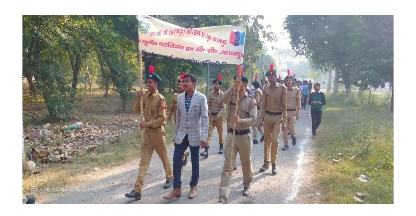
Awareness programme through Rally Theme: Good bye POLIO