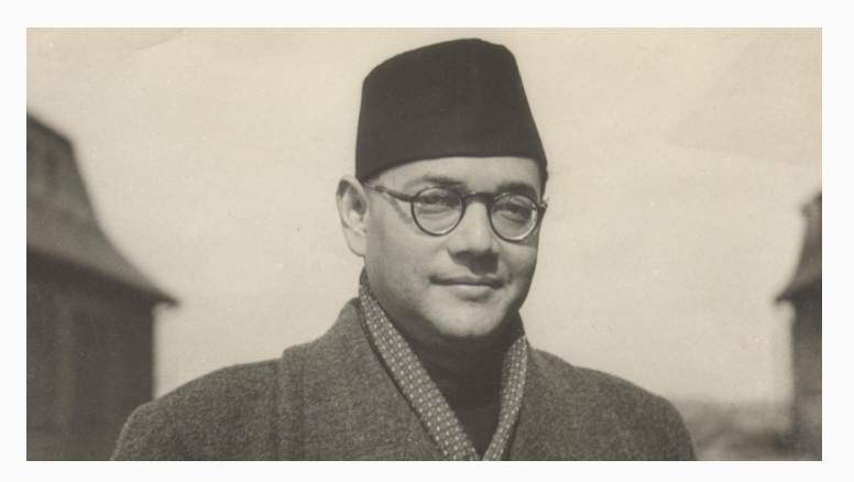
One individual may die for an idea, but that idea will, after his death, incarnate itself in a thousand lives.

Calling for committed thoughtful young citizens who aspire to change the world! Brilliant young minds will come together for focussed discussions on key environmental issues.