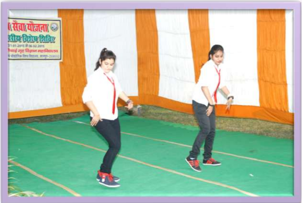
Yoga, Physical Fitness, Health and Hygiene Awareness Programme