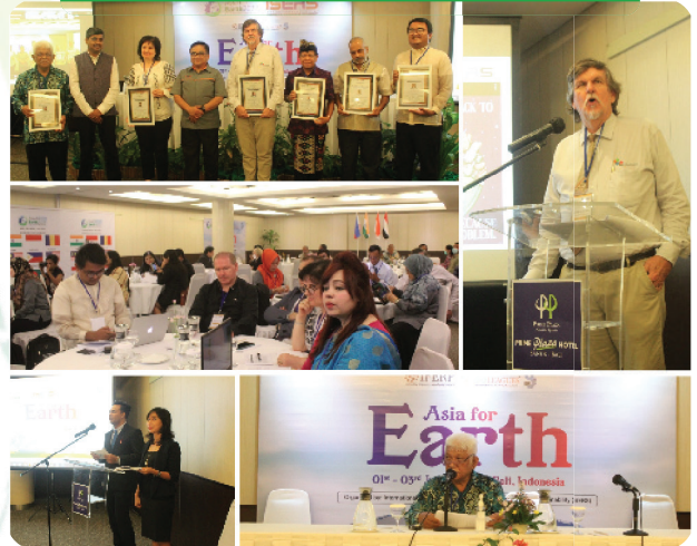
8th Go Green Summit, Bali Indonesia