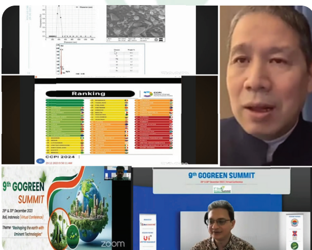
9th Go Green Summit, Bali Indonesia